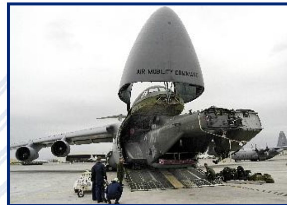
C-5 avg age 29.5 yrs 52.7 MC