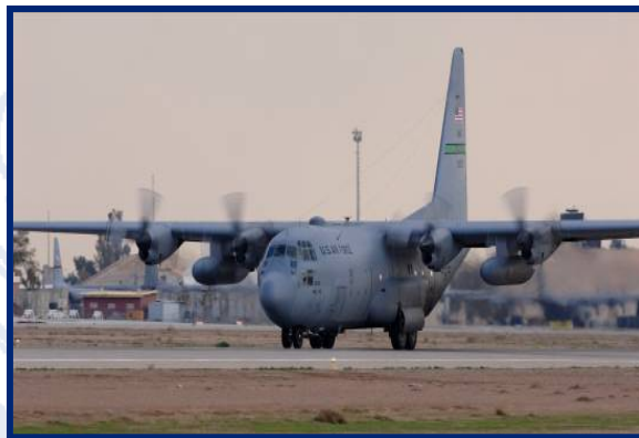
C-130 avg age 24.8 yrs 77.3 MC