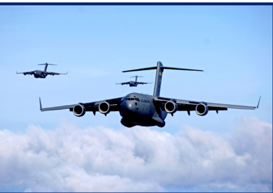
C-17 avg age 6.9 yrs 86.6 MC