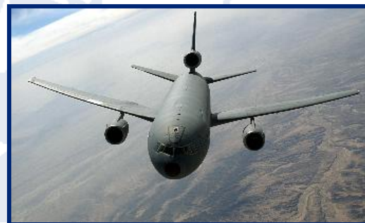
KC-10 avg age 23.4 yrs 81.6 MC

...Maintenance requirements are increasing