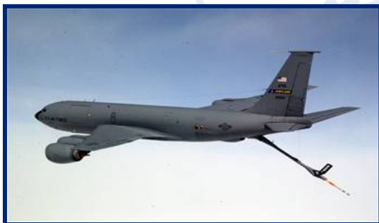
KC-135 avg age 48.5 yrs 84.1 MC