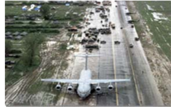
Reduces Manpower: 3-person Aircrew; Breaks less and is easier to fix