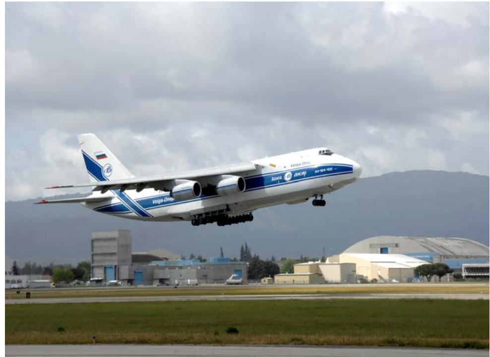
Photo: A US-contracted Russian AN-124. The aircraft are contracted by the U.S. military because of burgeoning global airlift demands.

A KEY MOBILITY STUDY IS SET FOR COMPLETION IN 2009