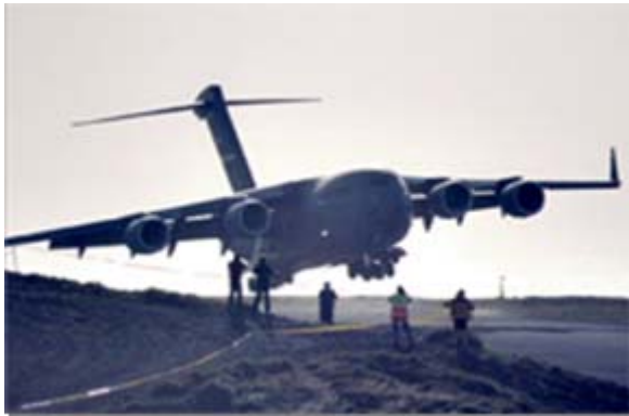
Direct Delivers Over Intercontinental Distances into Small Austere Airfields