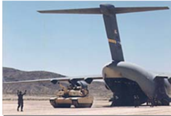
Carries Airborne Troops Anywhere: "Long Flight, Ready to Fight"