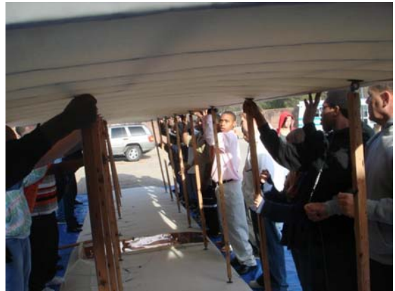
Cadets mate the upper wing on their Wright Flyer

Not so! At no cost to the Air Force, mentors guided the cadets through a project most adults would not attempt. In the end, this project brought together the school and community. The cadets at NC-945 know they can succeed in life by Aiming High and working together as a team.