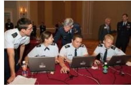
General Norton Schwartz, Chief of Staff, USAF, talks with Team Schriever of Dr. Phillips HS, during CyberPatriot I .

The 26-27 February 2009 Concept Demonstration of a National High School Cyber Defense Competition was held in Orlando, FL, in conjunction with AFA's 25 th Annual Air Warfare Symposium. Seven Air Force Junior Reserve Officer Training Corps (AFJROTC) teams and one Civil Air Patrol (CAP) team from the greater Orlando area competed — all were given names of prominent former Air Force or Civil Air Patrol Leaders. Winners were selected on each day of the competition, and Team Spaatz (for General Carl "Tooley" Spaatz, first USAF Chief of Staff) took Thursday and Overall honors. Friday's winner was Team Wilson (for Gil Robb Wilson, CAP co-founder), a composite team from the Florida CAP Wing.