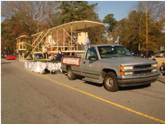
The Wright Flyer debut in a Pinetops, NC, parade.

The South West Edgecombe High School AFJROTC unit (NC-945) returned from a Curriculum in Action (CIA) trip to the Smithsonian Institute and Kitty Hawk, North Carolina. They used the inspiration of the trip to build their own full scale mockup of the original Wright Flyer. When they asked their instructors if they could build the replica, instructors thought the cadets wanted to build a scale model.